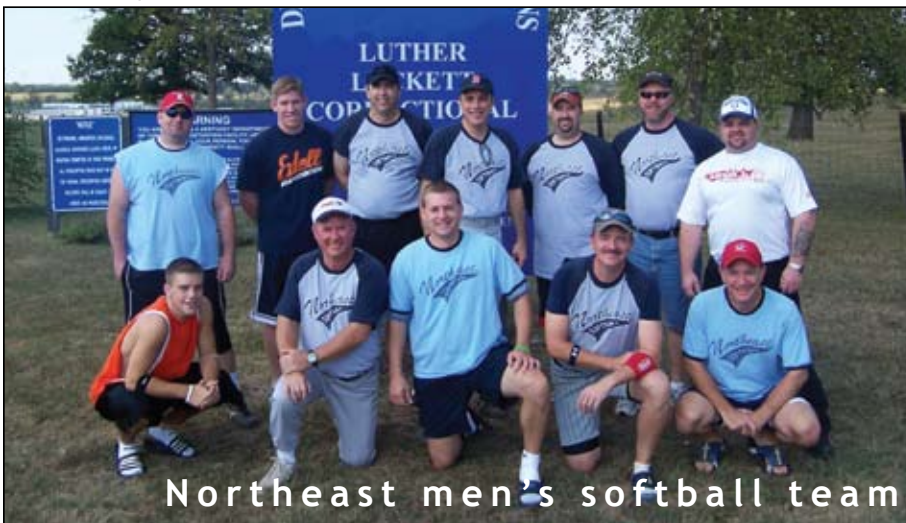
Northeast men's softball team