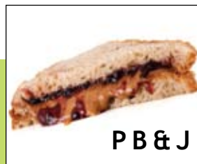
P B & J

PROM PROJECT expresses God's love to high school girls, and their families- who lack financial resources, by fulfilling their dreams of attending prom through the gift of a gown.