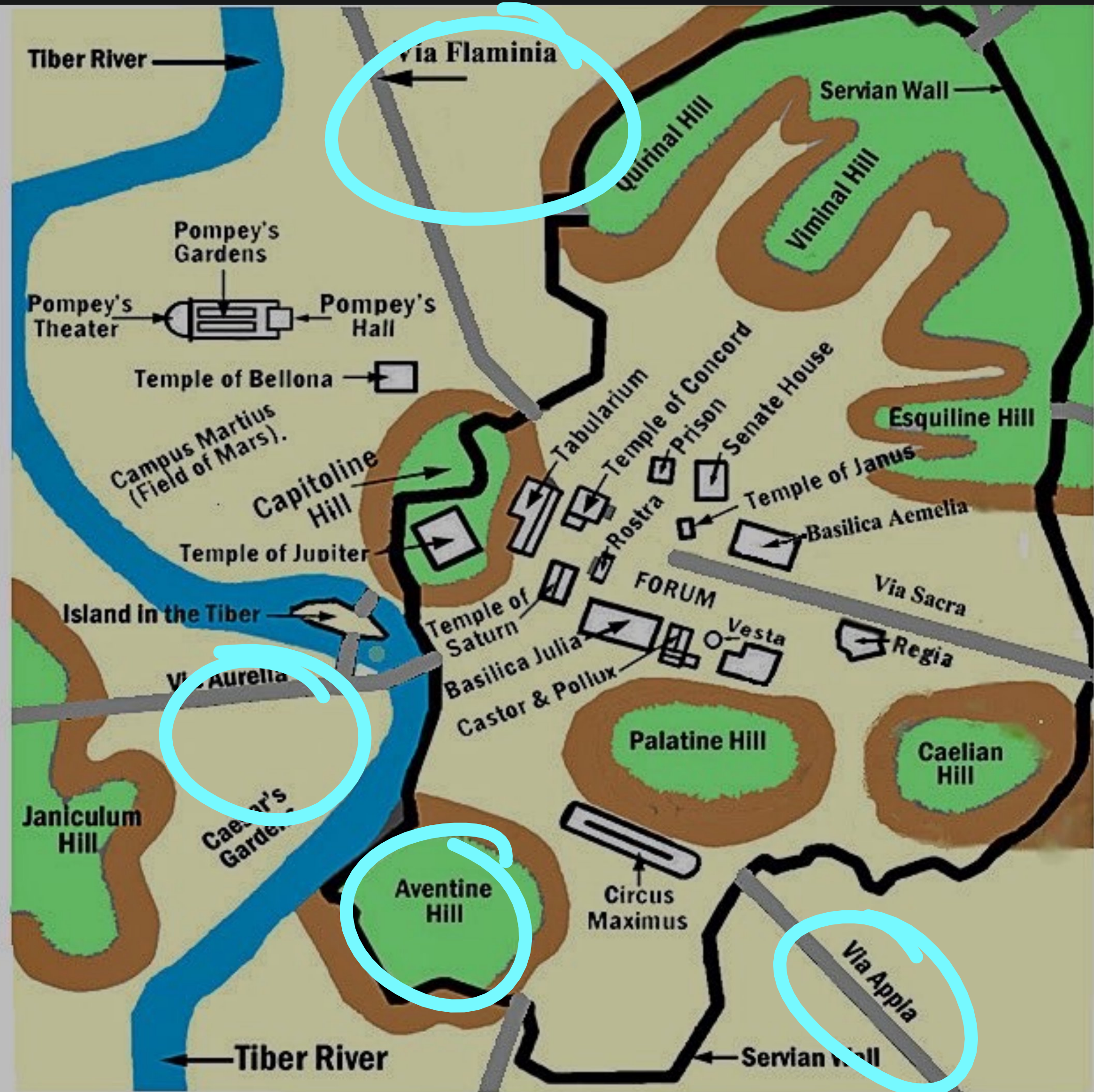
Rome - 1st Century BC