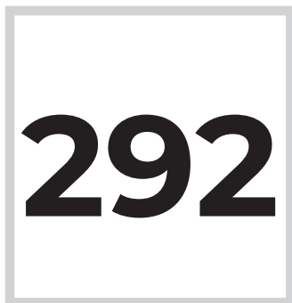
TOTAL 6/8 & 9/12 YOUTHS AT CAMPS & RETREATS