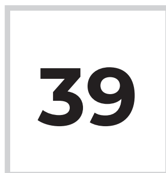
TOTAL 6/8 & 9/12 YOUTH BAPTISMS