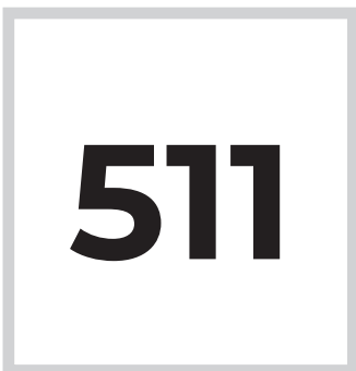
TOTAL 6/8 & 9/12 YOUTHS

Youth assembled 39 beds for our Build-A-Bed project to help families needing a bed for their child. These beds were accompanied by a mattress, sheet set, pillow, and often a “stuffie” or book!