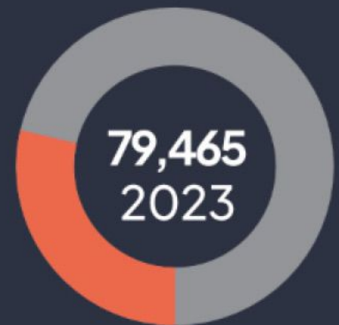
Metro Louisville Immigrant Population